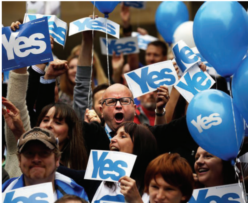
For a free nation: A pro-Scottish independence campaign rally, in central Glasgow, Scotland in September 2014.

How has the demand for independence progressed over the years? What has been the role of the Scottish National Party? Why has it been demanding an independent Scotland? What does the new party leadership mean for Scotland's prospects?